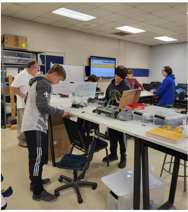
Engineering students building robots in preparation for the next step, which will be programming.