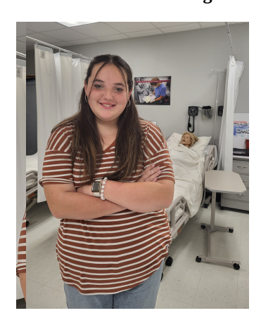
Aubrey Burk Health Sciences