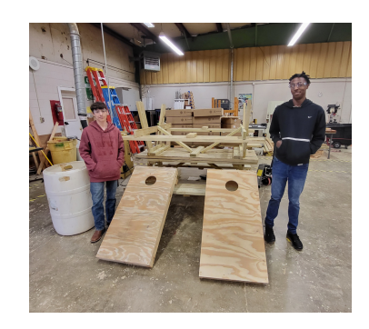
Corn holes and picnic tables are part of the fund raising for the Construction/Carpentry students. Please help suppport them.